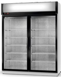
S/AG model R-290/ ecoline /standard