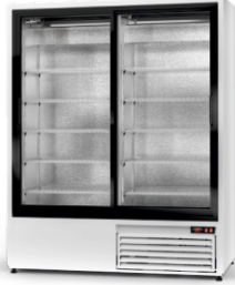
SR model R-290/ ecoline /standard