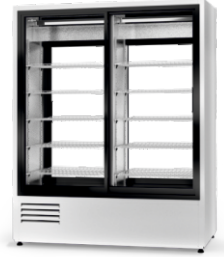
2S2R model R-290/ ecoline /standard