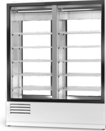
2SR/1D; 2S/1D model R-290/ ecoline /standard