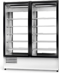
2S model R-290/ ecoline /standard