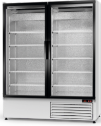
S model R-290/ ecoline /standard