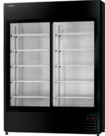
SR/WH model R-290/standard