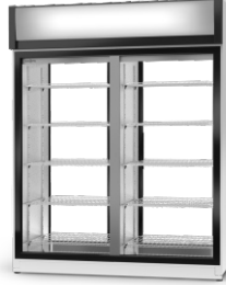
2S/AG/1D model R-290/ ecoline /standard