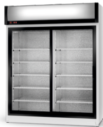
SR/AG model R-290/ ecoline /standard