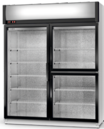
S/AG/3D model R-290/ ecoline /standard