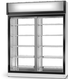
2SR/AG/1D model R-290/ ecoline /standard