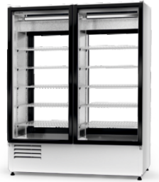
2SR model R-290/ ecoline /standard